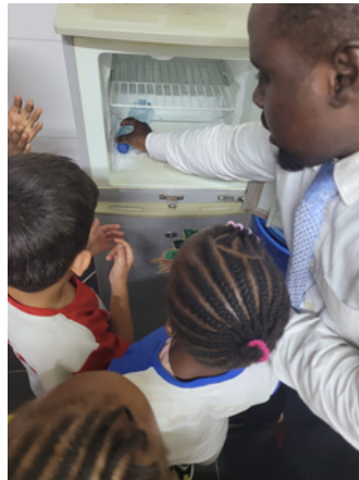
"Putting It To Test"

Experiments to test and understand scientific theories.