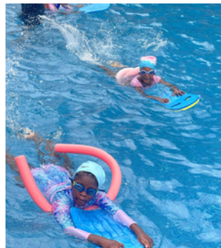
"Jack Of All Trade"

Improving vocabulary and world knowledge; Valentine themed art craft; Strengthening and developing muscles through swimming.